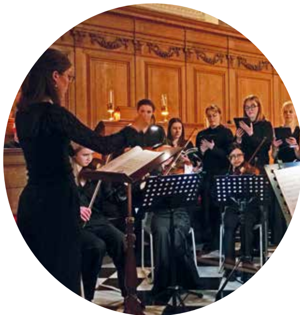
Members of ECMS at a recent performance

Finally, the Central Colleges Orchestra rounded off the concert with a Mendelssohn march, Finzi's A Severn Rhapsody and Dvořák's Humoresques .