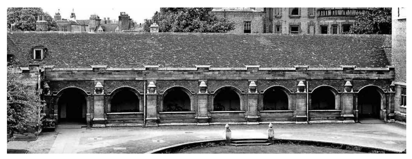
The original North Court cloister

North Court, completed just before the First World War, may seem to radiate a timeless, unchanging aura, but in fact the western range, comprising the porter's lodge and attached cloister, was extensively altered in the 1960s.